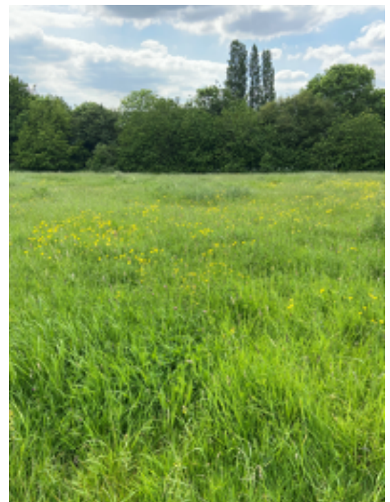
Look at the lush result now!