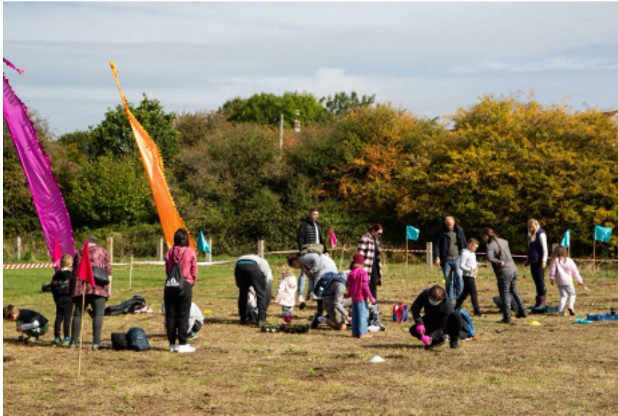
1ST October 2022, planting the wildflower plug plants was very difficult as the soil was so dry and hard. Thank you for persevering! See what you achieved!

The Friends of Siston Commons would like to thank all of you who have helped to create the wildflower meadow on Siston Park Common. Thank you for keeping to the paths to allow the seeds and plants to grow. Thank you for clearing up after your dogs and for keeping the footballs off the new plants! Enjoy looking at the variety of new trees, wildflowers and grasses; the insects they will attract and the birds which will like the insects. This is a wonderful part of the Common Connections which is bringing nature back from the brink. You can work the same magic in your own garden if you are lucky enough to have one.