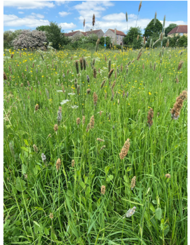
25TH May 2023, the plants have grown and look beautiful.