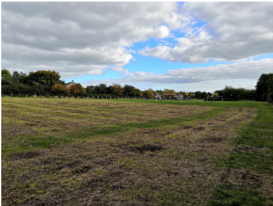
It looked really strange and empty after it had been scarified and seeded.