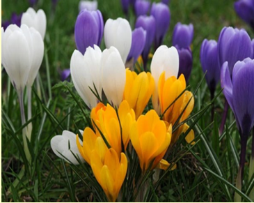
Watch out for our crocus in early February

A 'Big Thank You' to all residents who came together to make it a very successful day.