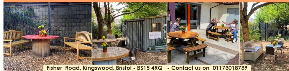
Fisher Road, Kingswood, Bristol - BS15 4RQ - Contact us on 01173018739